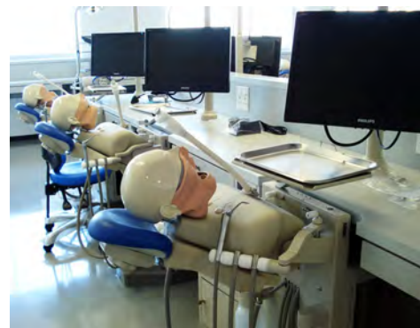
UWC Oral Health Center at Mitchells Plain